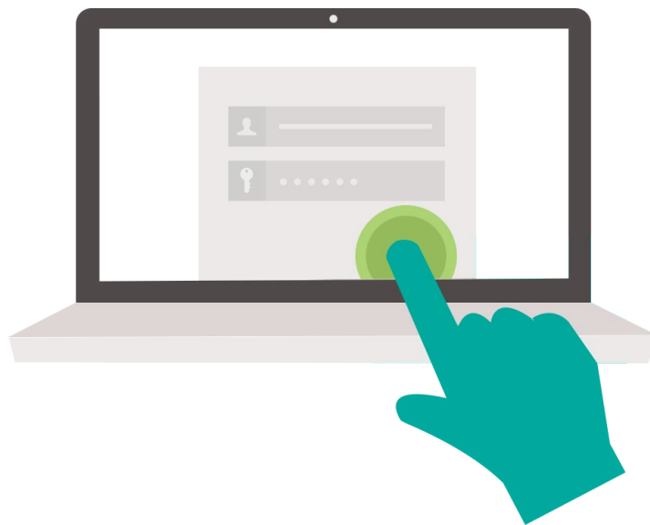
Sign up Forms Simple & Accessible

Make your sign-up forms more accessible at different levels of your website. Zoho Campaigns has several different types of sign-up forms to offer: embedded form, button form, quick form, or URL redirecting visitors to a sign-up form on your web site. You can also consider changing the language of the sign-up form to suit the needs of your web site or to match the language of the country where your business is based.