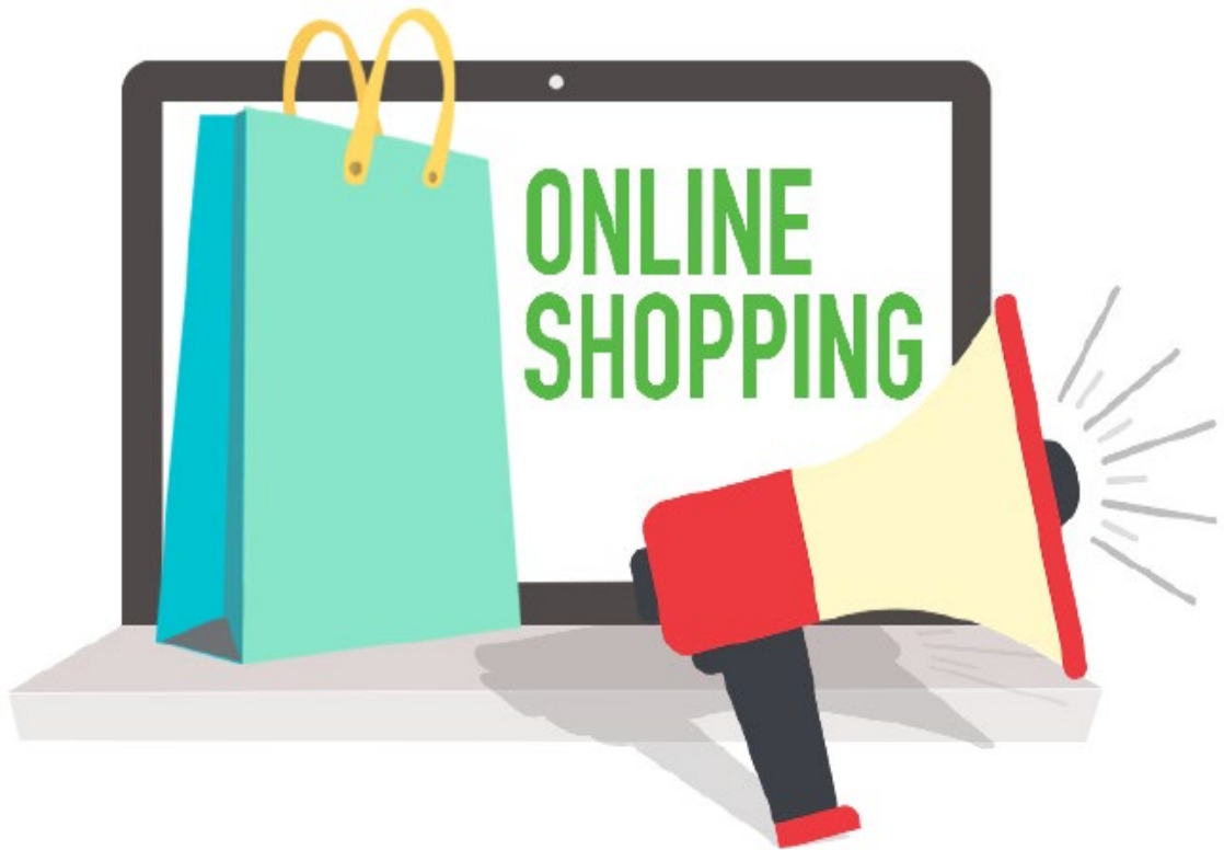
Target customer in online shopping

An other simple way to gather more email addresses is via online shopping. All you have to do is include a field where customers can add their email address when completing an online purchase.