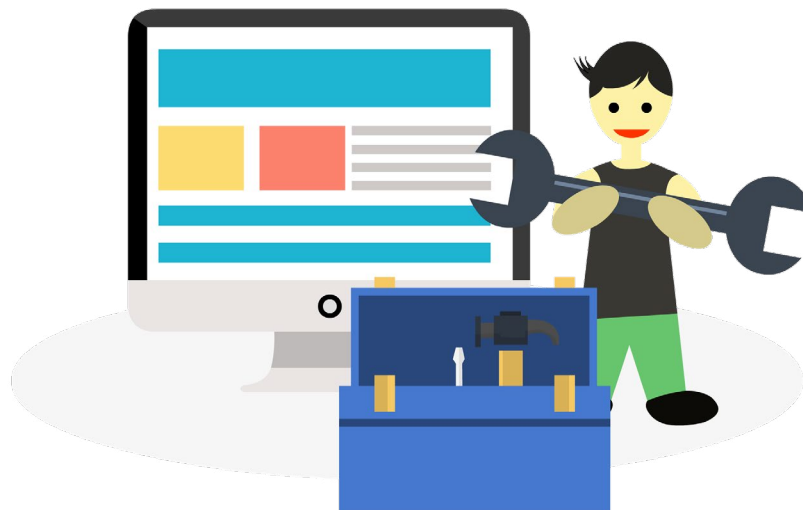
Maintain a Clean Web site

Keep your website design user friendly to ensure your website visitors can navigate from page to page and find any piece of information with ease. Try our smart sign-up forms for a minimalist look to your website. This will make your website look clutter free while also providing a smart sign-up form. An interactive website makes your business stand out.