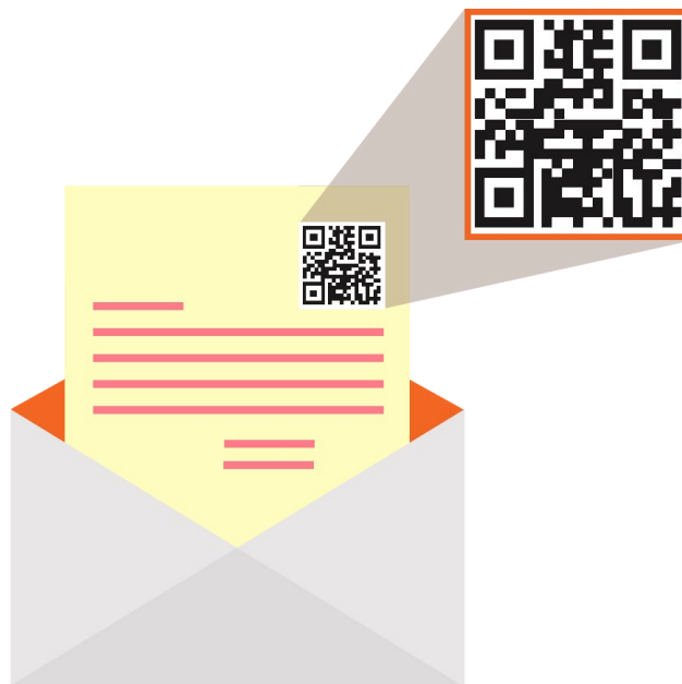
Use QR code to promote sign-up form

Generate a QR Code for your mailing list and add it to marketing channels like your newsletters, blogs, and banners. Contacts will scan your QR code to get redirected to your sign-up form.