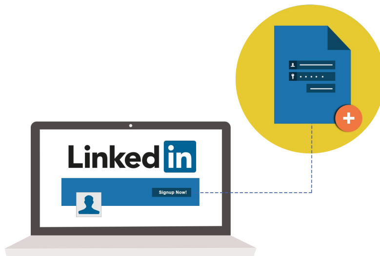
LinkedIn Company Page

Add a sign-up form for your email campaign on your LinkedIn company page to spread awareness with like-minded professionals. Use LinkedIn to maintain communications with existing customers. They will be more likely to continue using your brand if you clear up their questions and complaints quickly.