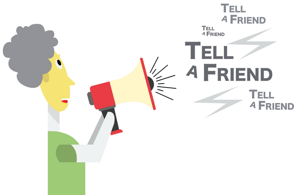
Include "Tell-a-Friend" and Share Links

The oldest form of marketing is simply spreading your word through the people you know. Include social media sharing buttons and people who like your campaign will spread the news for you.