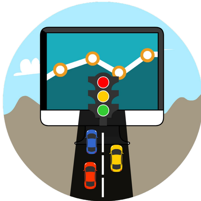
Increase Traffic to your Website

Increase your website traffic using search engine optimization (SEO) and other inbound marketing tools and techniques. Also, include sign-up forms on different webpages such as your home page, blog, and forum.