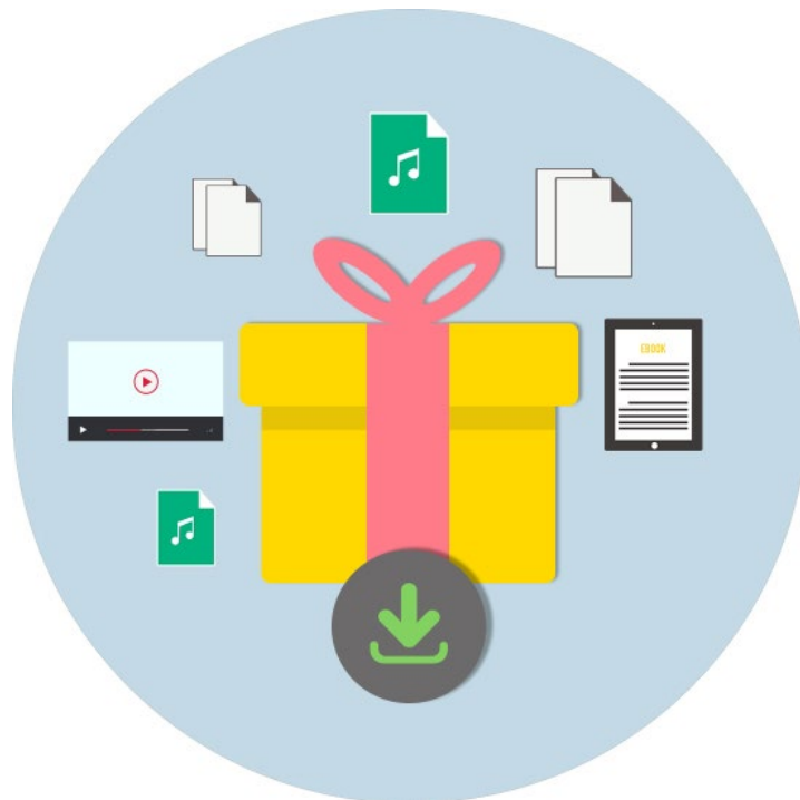
Provide Downloadable Content

Upon successive sign-up completion provide free downloads such as ebooks, whitepapers, and other research materials. You can redirect your Contacts to downloadable content by simply adding the webpage URL where you want to redirect your visitors in the response configuration page.